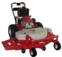
Commercial Lawn Mowers

Other fine products offered by DEK Heavy Duty Power Equipment