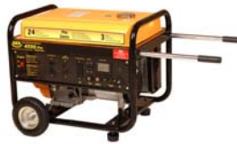
Rental Grade Generators