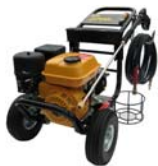
Heavy Duty Pressure Washers