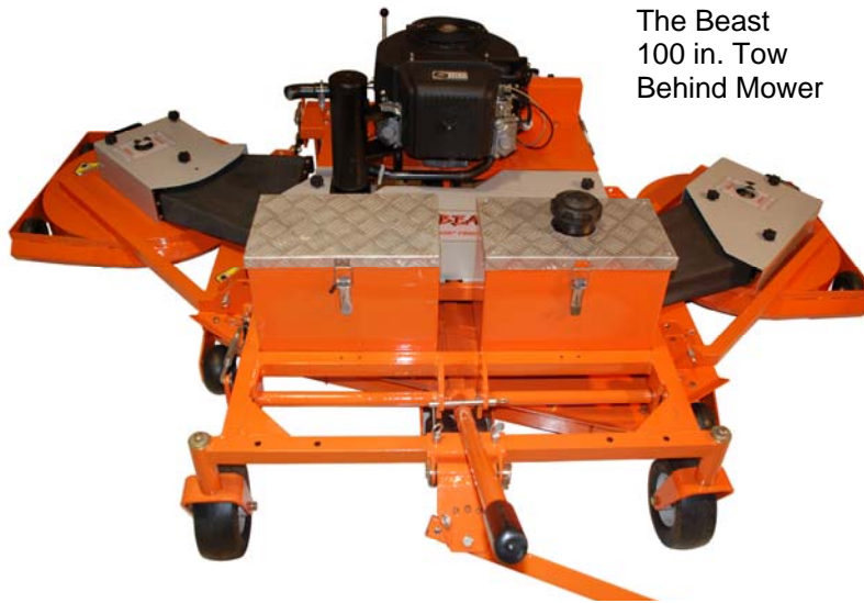
The Beast 100 in. Tow Behind Mower