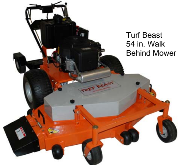
Turf Beast 54 in. Walk Behind Mower