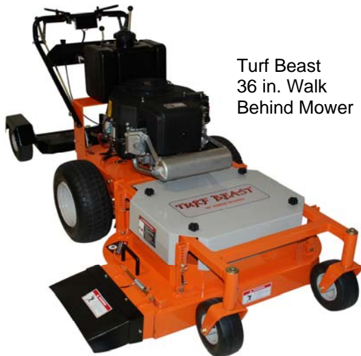
Turf Beast 36 in. Walk Behind Mower

Check out our other great products at www.HomeDepot.com or visit our web site at www.beastpowerequipment.com