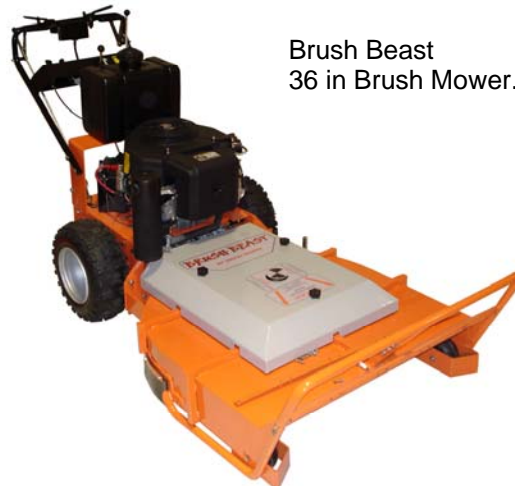
Brush Beast 36 in Brush Mower.